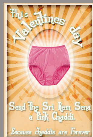
PINK CHADDI CAMPAIGN